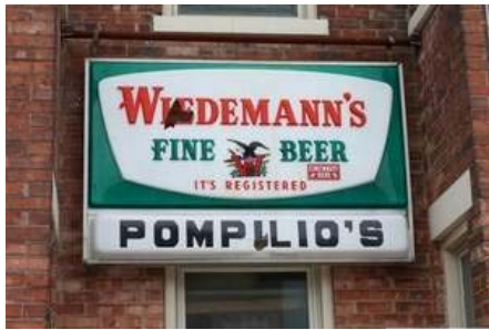
A sign from the original Wiedemann brewery still hangs in Pompilio's.